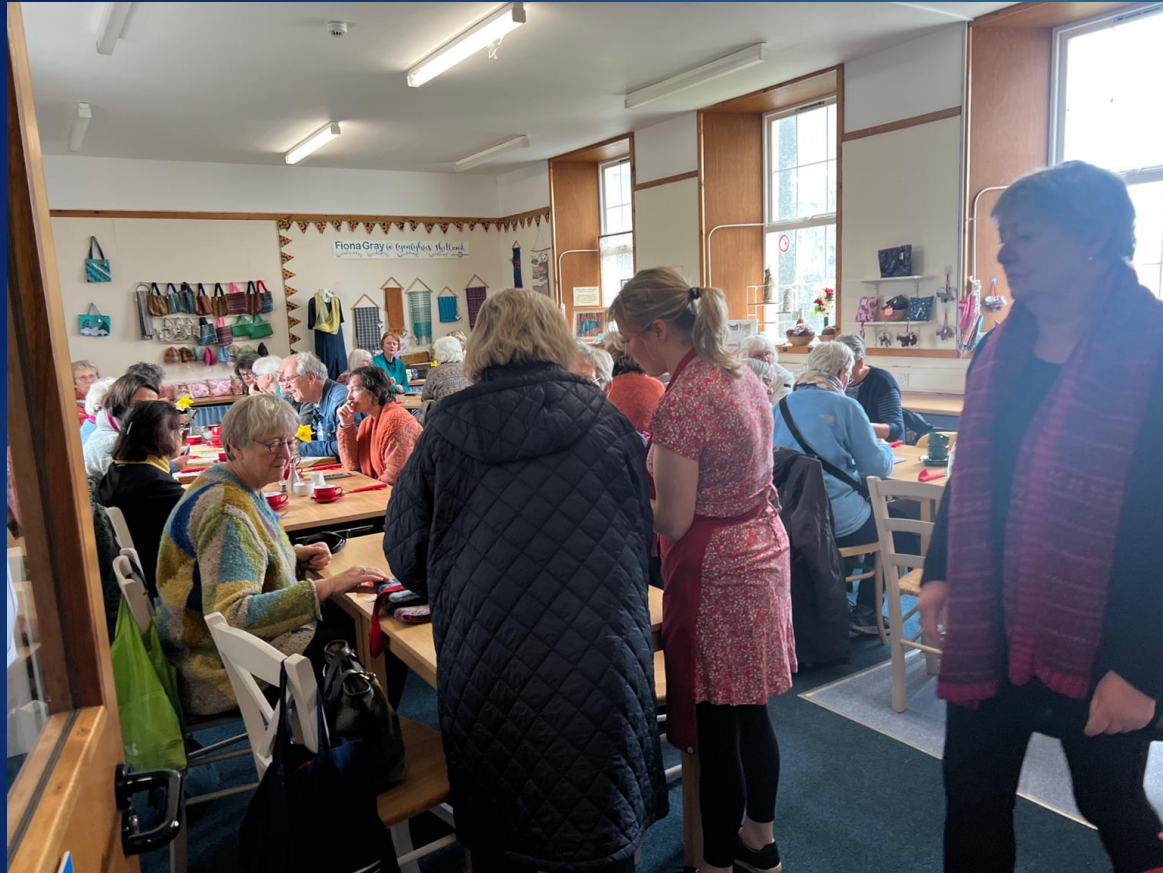
Classroom becomes cafe overspill/craft sales/meeting and workshop room