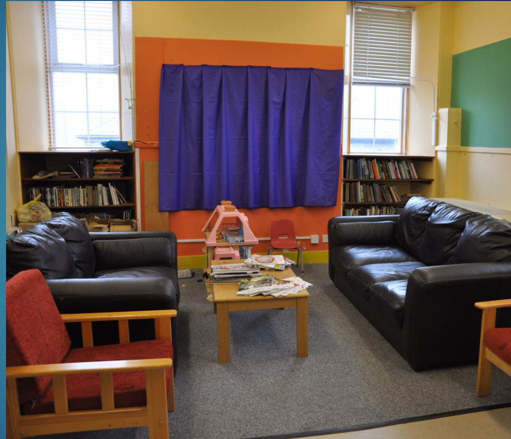
General purpose room