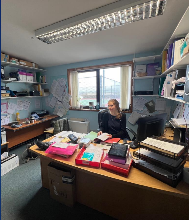
Office becomes BDL/community office space