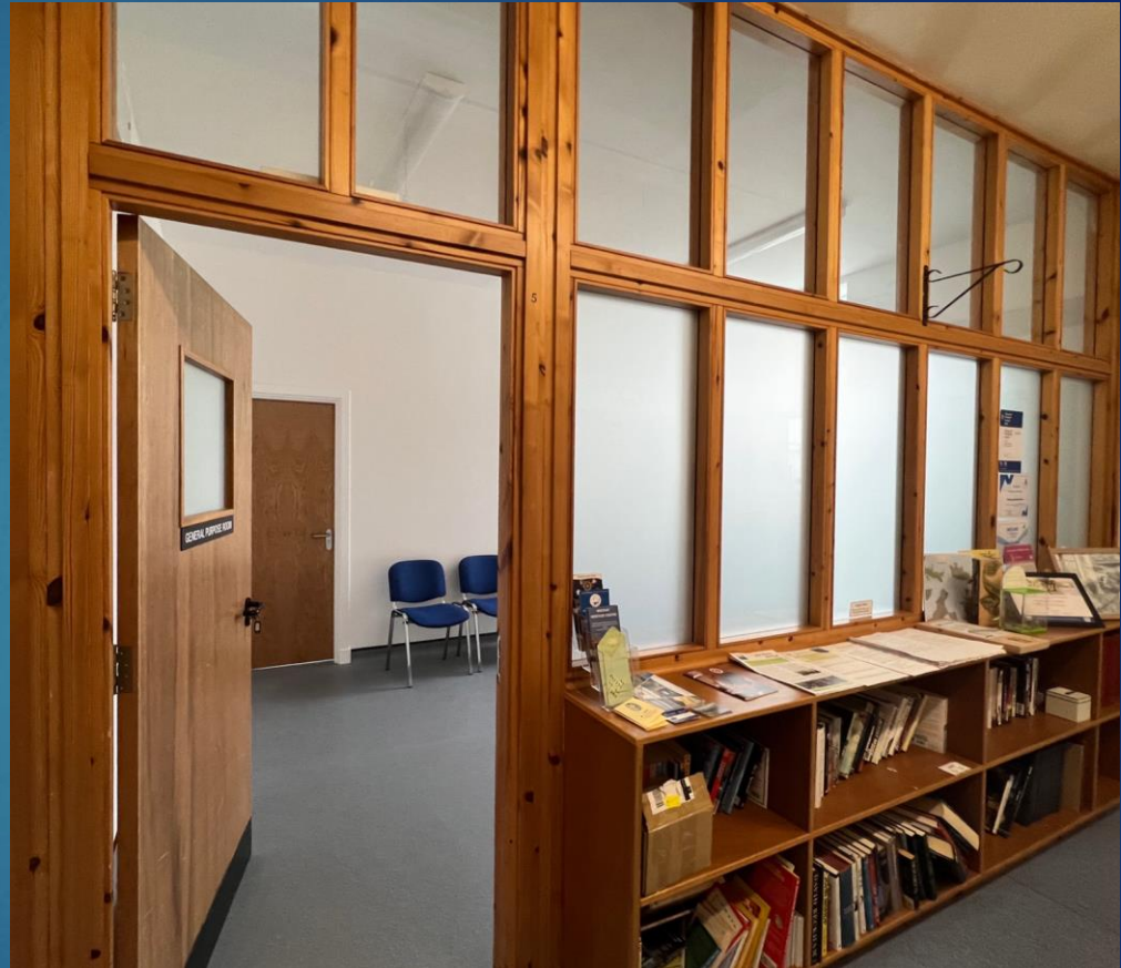
General purpose room is now NHS room