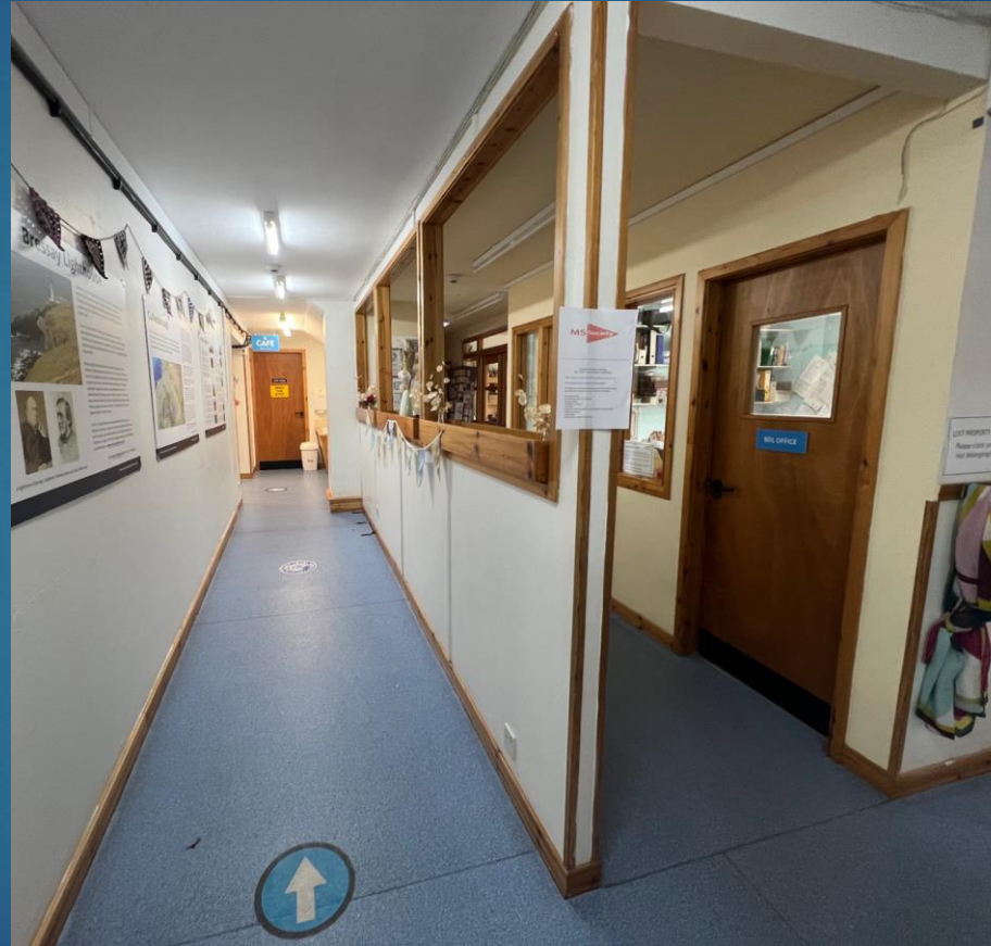
Other staff areas and the remaining classroom become Artists' studios