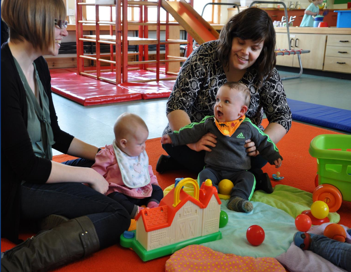
Under 5's Group