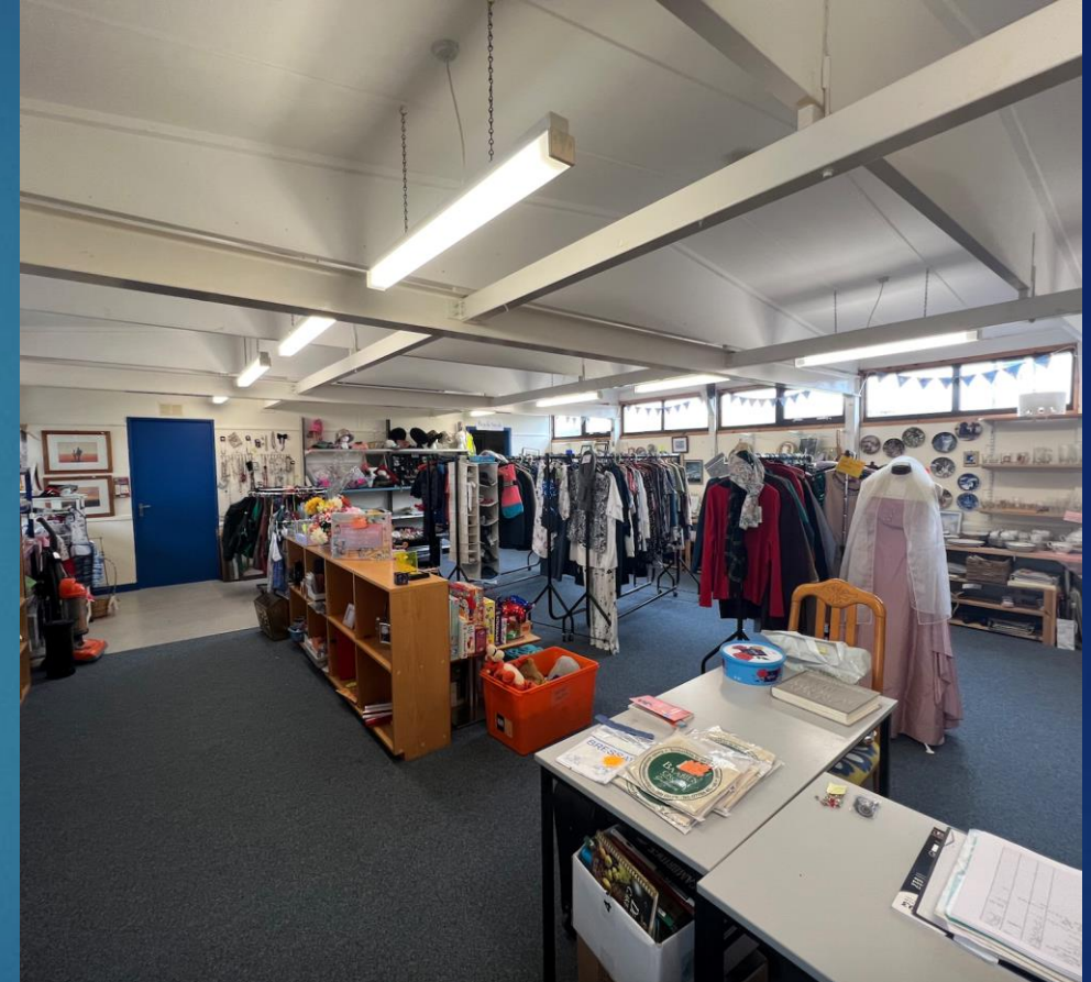
Good As New Shop