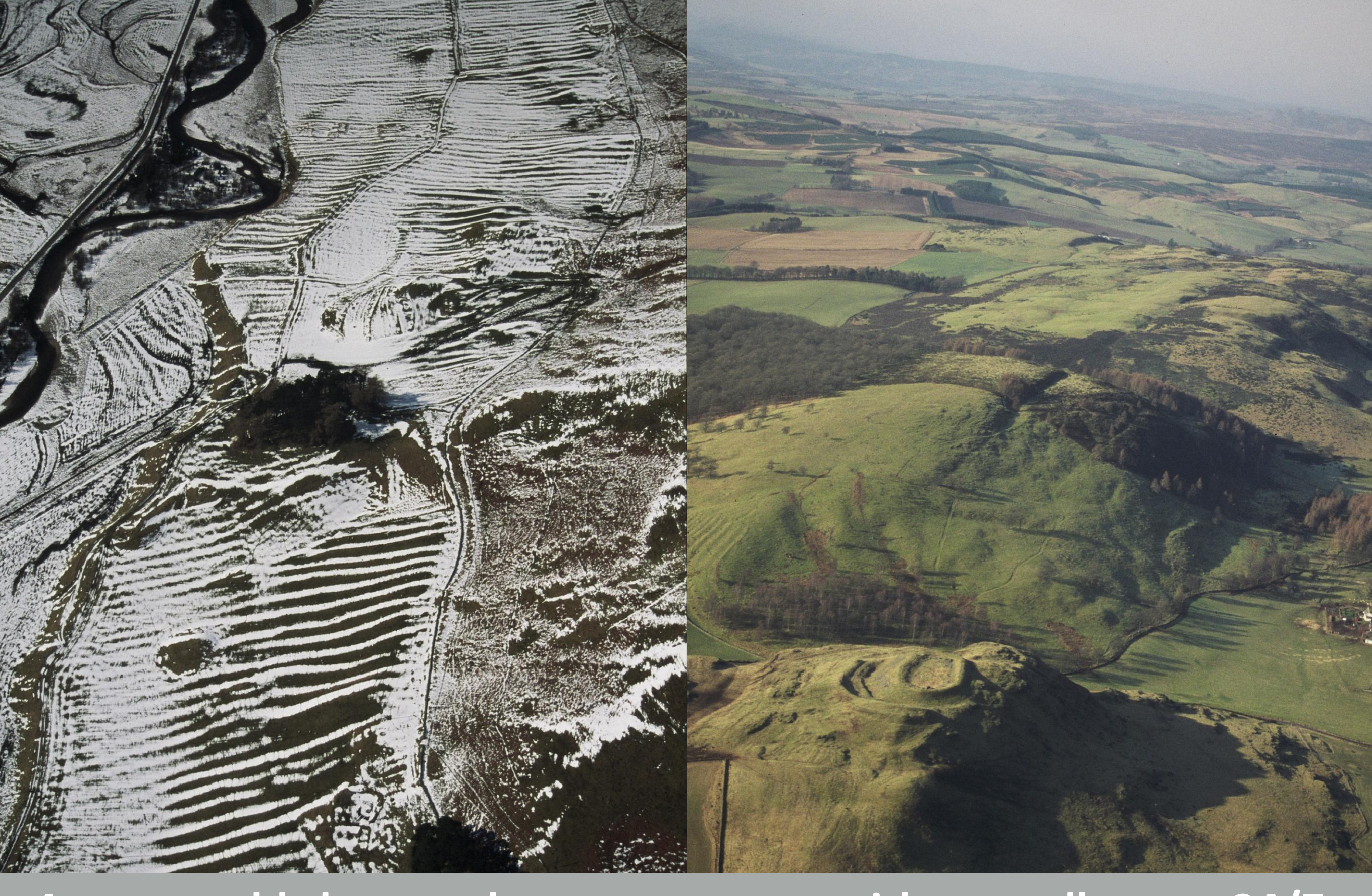
A new world class outdoor ecomuseum without walls open 24/7, set in the landscapes of Cateran Country