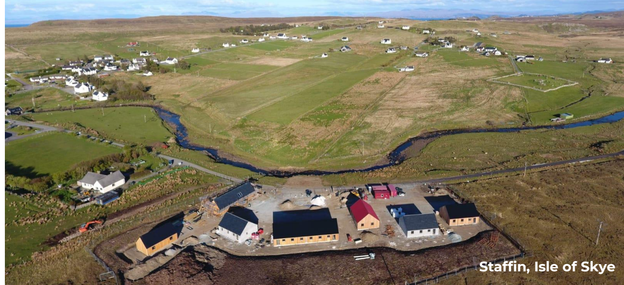
Staffin, Isle of Skye