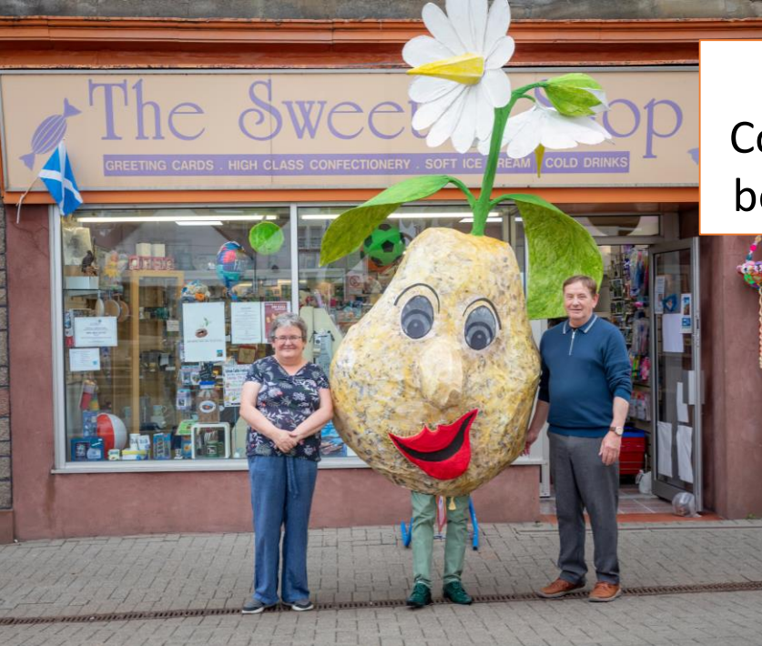
Tattie Trail, live music and free food at Community Gardens, free pro photos on the beach, arts & crafts, and alpacas (obviously)