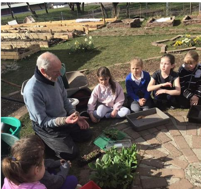
Clockwise from top left – sharing stories at an American Years pop-up exhibition; active travel promotion via the Dunoon Bothy Project; intergenerational connections at Grow Food, Grow Dunoon.