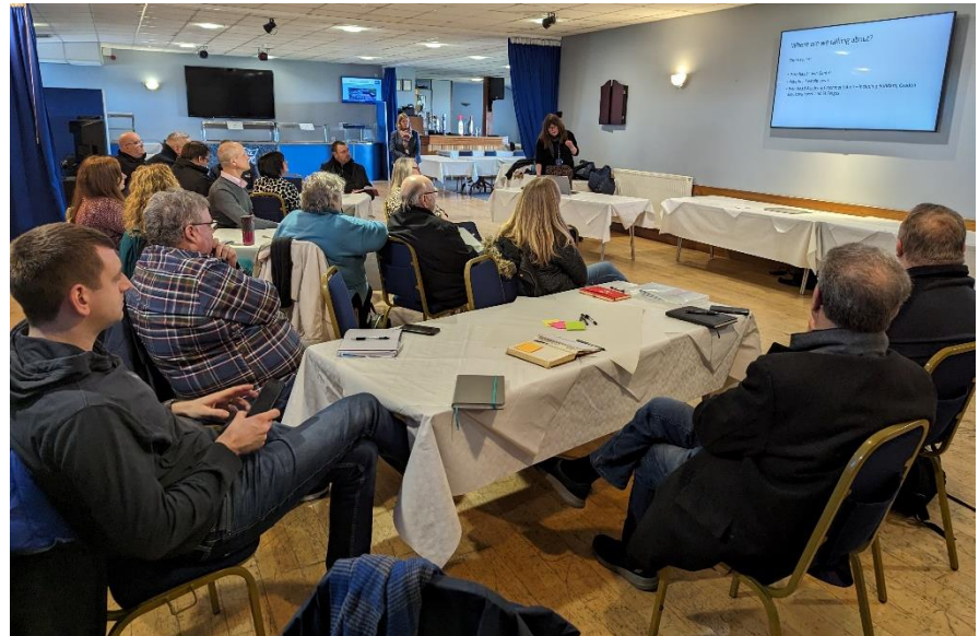
SURF managed a set of Peterhead 2040 consultation events in the football stadium

Linda’s other engagements and activities include: working with Aberdeen Foyer and other players to create a Poverty Hub, with priority plans to raise awareness of food banks, healthy eating workshops and growing spaces; a “Parking Buddies” project to respond to community demands for improved road safety around schools and nurseries; project support for community led park and green space in the town centre, and a prospective community asset transfer for an historic town centre church; and a plan to rehabilitate the Lido in Peterhead for community and event activity.