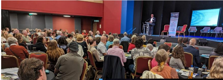
120 guests attended SURF's 2023 Annual Conference in Kilmarnock