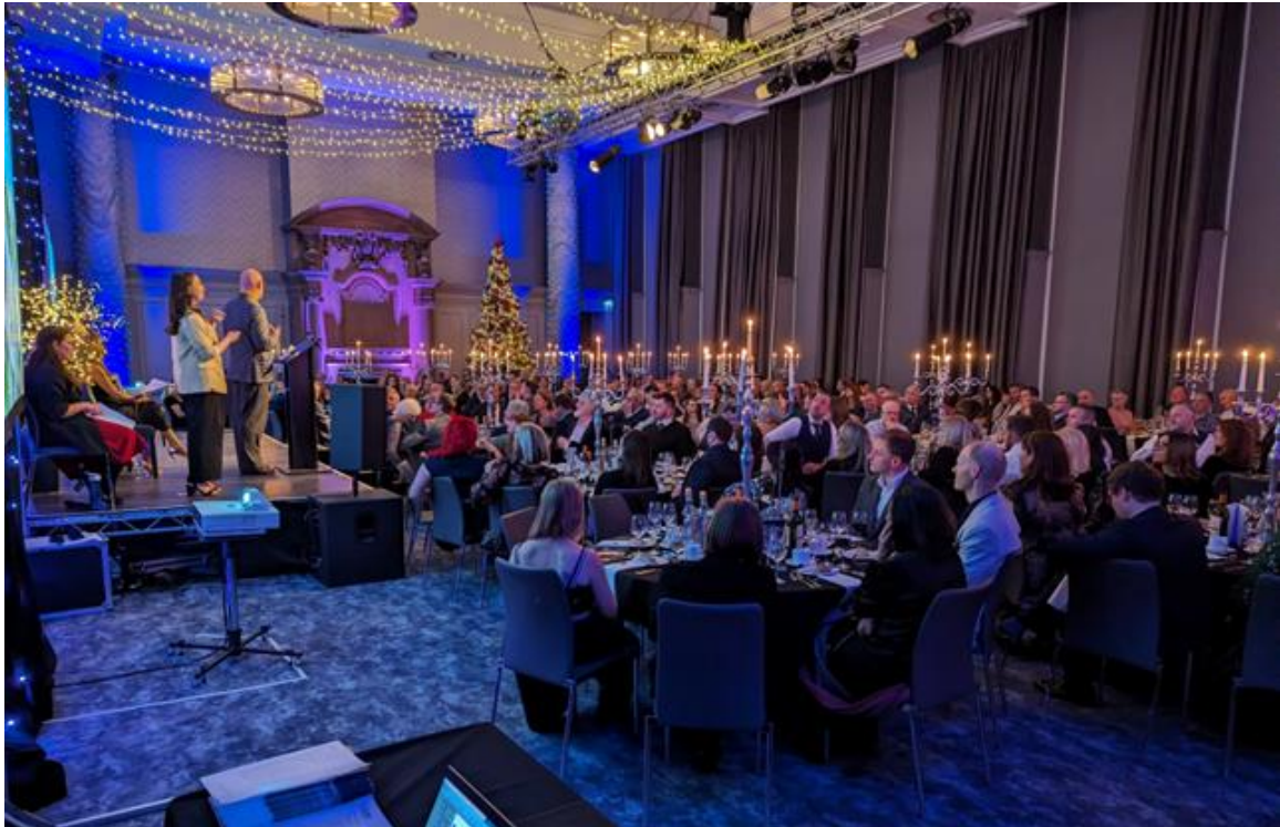
The 2023 SURF Award outcomes were revealed at a packed Presentation Dinner in Glasgow

For more on the 2023 SURF Awards process, please visit: https://surf.scot/surf-awards/surf-awards-2023/