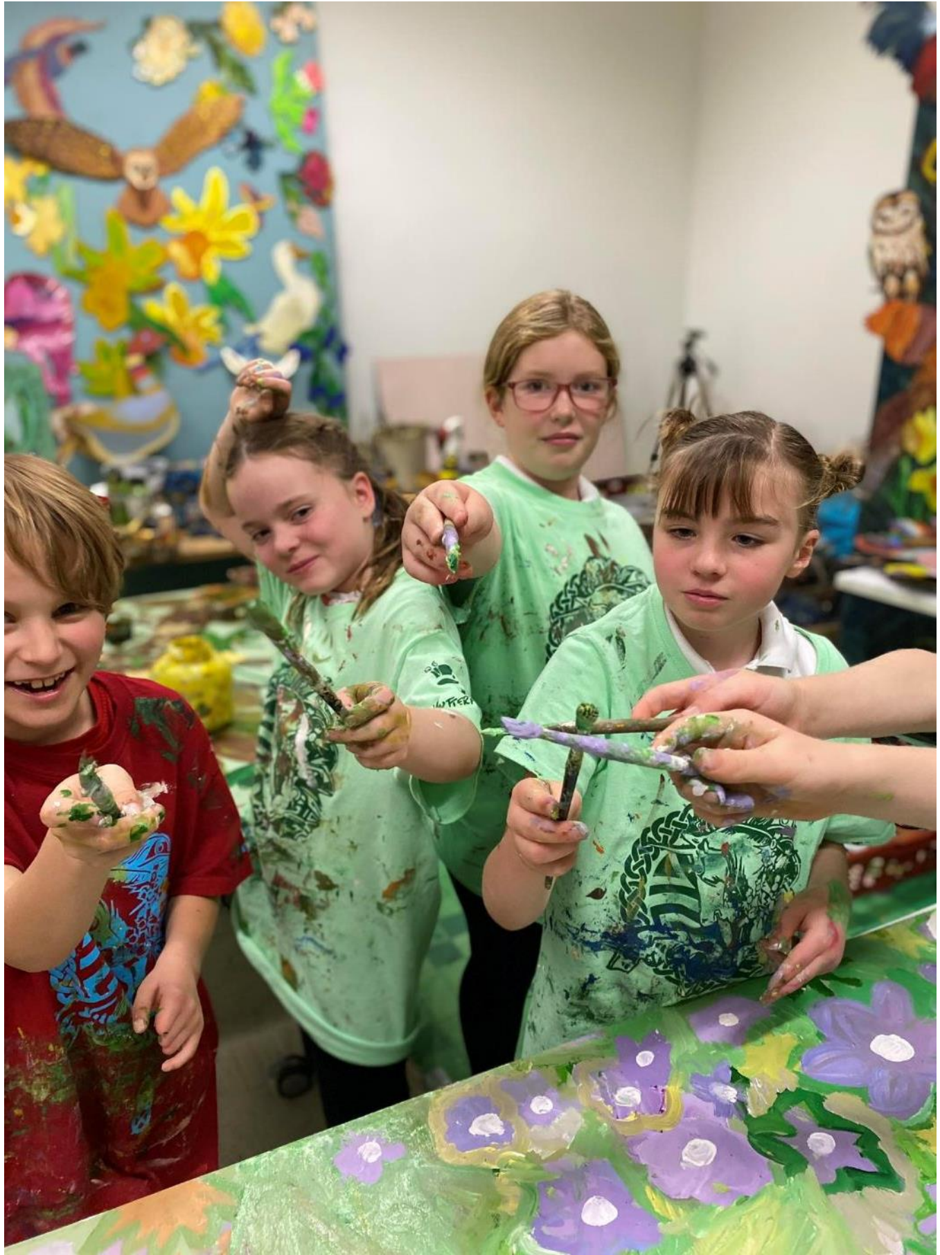
35 Inclusive Mural Art Workshops